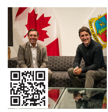
I was pleased to welcome Prime Minister Justin Trudeau to City Hall to thank the federal government for $114 million in funding through the Housing Accelerator Fund. (Oct 2023)